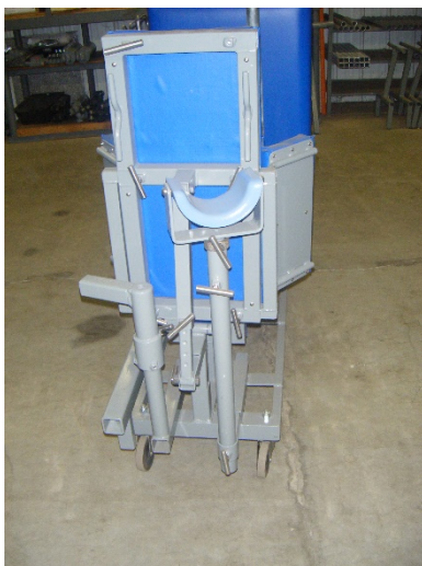
D/L STORAGE CART DIAGRAM